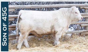
SON OF 45G

PRO-CHAR CURLY 98B LEGACYS DOMINO 52D LEGACYS AYOMING 5A