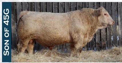
SON OF 45G