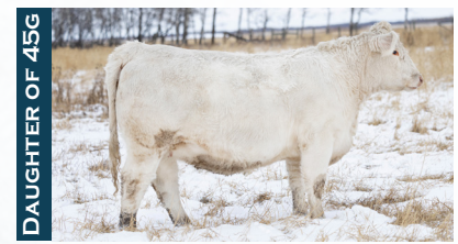
DAUGHTER OF 45G

Game Day made his debut in 2019 at the Alberta Select as part of Legacy Charolais' Pen of 3 Bulls. His structural correctness and disposition were apparent as a calf and gave a glimpse at just what a true breeding bull he would become as he matured. He topped Legacy's 2020 sale, selling to Poplar Bluff Stock Farm. Since that time, Game Day has consistently sired sale topping bulls for both programs. Game Day is homozygous polled, long bodied and his disposition is second to none. He sires progeny with added performance, hair and impeccable foot structure. His daughters are impressive young cows with flawless udders. This will be the only Game Day semen offered for sale this spring - don't miss your opportunity to utilize this proven, performance herd-bull maker! Homo Polled